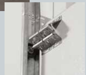
Vertical track with roller