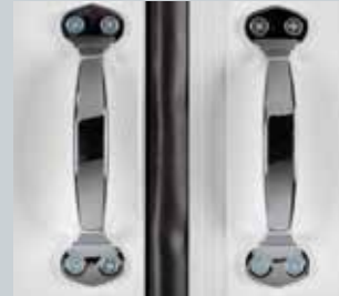
Exterior bow handles

The HDPE has no wood fillers and has high color stability. The strength, durability and overall appearance of the HDPE mean that no additional steel cladding of the frame is required. Steel cladding of the HDPE is an option when the frame is required to match a non-white wall.