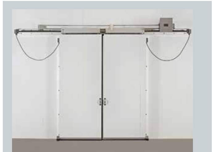
Bi-part power doors

Single vertical slide doors are available in standard sizes up to and including 10'0" WIC x 10'0" HIC. Doors over 8'0" WIC will be split due to shipping regulations. Please contact us for details of all other sizes.