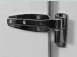
3 cam lift polished chrome hinges for even weight distribution