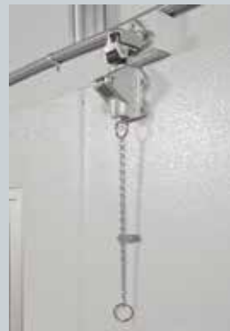
Dutch latch For double door only