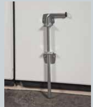
Cane bolt For double door only