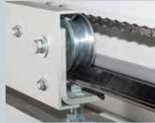
"V" grooved wheel and track