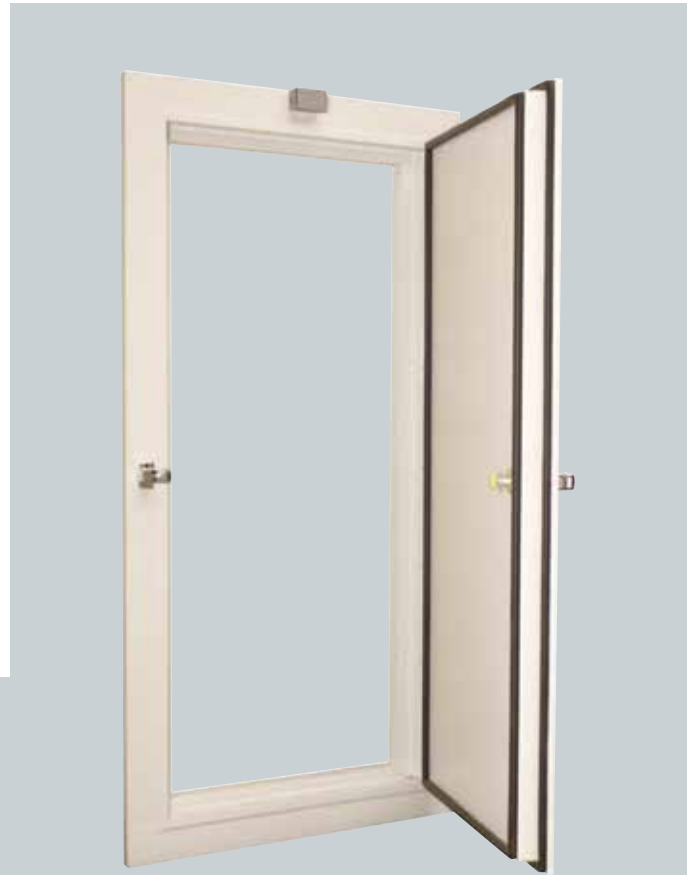
Double heat, double gasket option for extreme temperatures