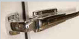
Single point padlockable polished chrome latch