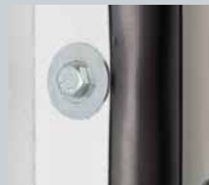
Adjustable reinforced door seals, mounted on casings and header, correct wall irregularities for a positive seal, eliminating warm air infiltration