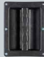
Interior recessed handles