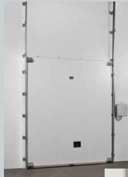
Single Vertical slide power door