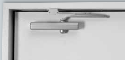
Interior/exterior door closer

Toll Free: 800-835-0001 Fax: 316-733-2434 sales@icsco.com