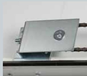
Chain adjustment assembly for #40 roller chain on power models