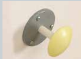
Interior push release, with nylon rod for freezer applications