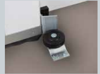
Floor mounted stay rollers