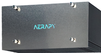
Everidge UV Pro

Regular walk-in coolers face constant threats from mold, viruses, bacteria, and allergens which lead to food waste and food safety issues...Let's fix that! Combine the power of three Everidge cutting edge technologies to ensure the highest standards of hygiene and durability in your cold storage.