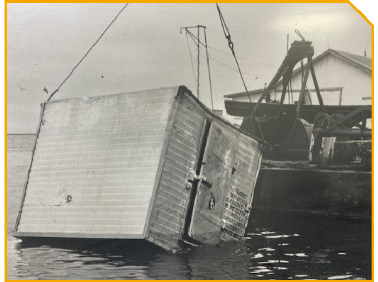
ICS walk-in recovered and reused from Hurricane Betsy devastation – 1965

Exclusive 20 Year Exterior Finish Warranty