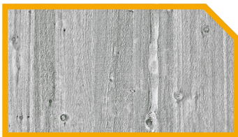
Rough Cedar White Wash (4K)